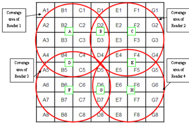
Figure 3. Three reader arrangement