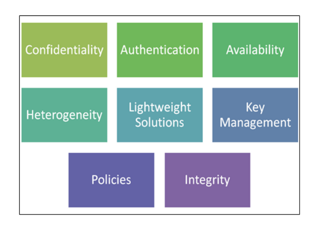
Figure 2. IoT security principles

integrity, availability and authentication are considered as basic goals in every computer or network security. Lightweight solutions on the other hand is a unique security feature that is introduced because of the limitations in the computational and power capabilities of the devices involved in the IoT. It is not a goal in itself but rather a restriction that be considered while designing must and implementing protocols either in encryption or authentication of data and devices in IoT. Since these algorithms or mechanisms are meant to be run on IoT devices with limited capabilities, so they ought to be compatible with device capabilities.