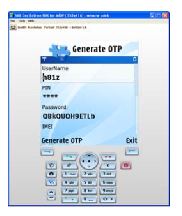
Figure 3: Snapshot of the client OTP program.

In order to setup the database, the client must register in person at the organization. The client's mobile phone identification factors, e.g. IMEI, and SIM card info, e.g. IMSI, are retrieved and stored in the database, in addition to the username and PIN. The J2ME OTP generating software is installed on the mobile phone. The software is configured to connect to the server's GSM modem in case the SMS option is used. A unique symmetric key is also generated and installed on both the mobile phone and server. Both parties are ready to generate the OTP at that point.