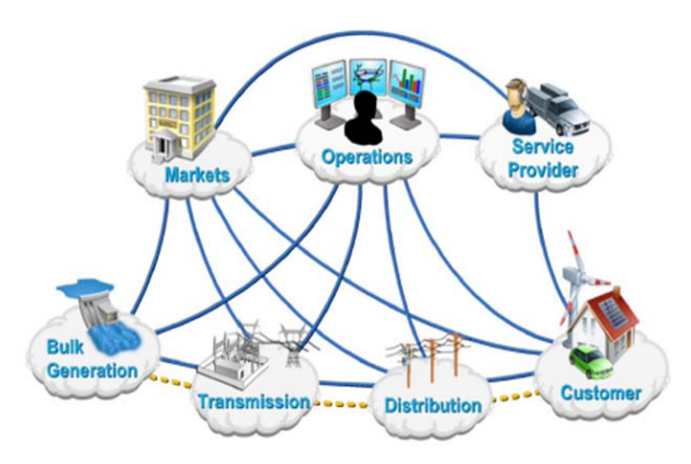
Fig. 1. Domains of a smart grid [NIST].

composed of seven domains as shown in Fig. 1. The grid can be viewed as having two main components, system and network.